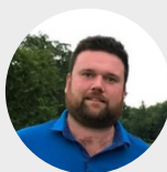
Craig Black Junior Committee